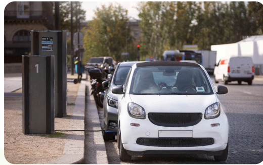
Public EV Charging