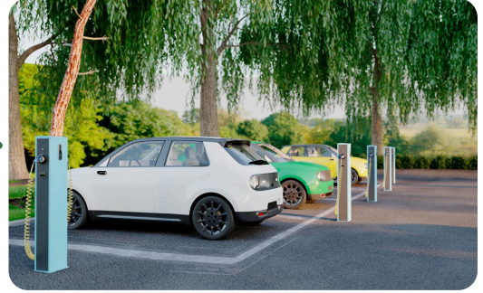
Workplace EV Charging