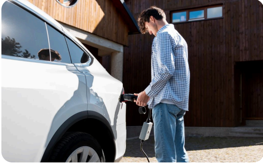
Residential EV Charging